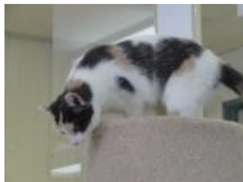
Jelly Bean Female/Spayed Domestic Short Hair/Mix 1 Year, 2 Months