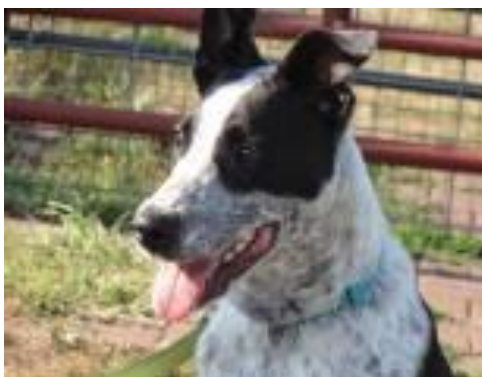
Topper Male/Neutered Retriever, Labrador/Mix 9 Months