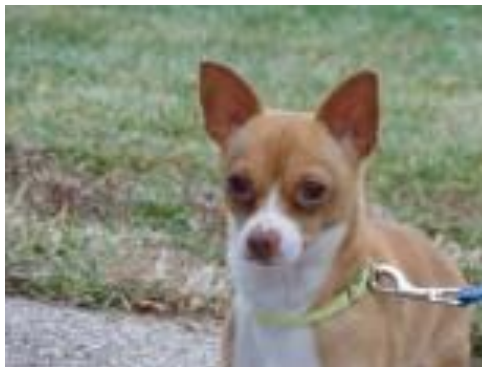
Shorty Male/Neutered Chihuahua/Mix, Short Coat 3 Years, 11 Months