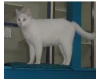
Comfy Male/Neutered Domestic Short Hair/Mix