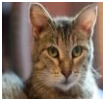
Emily Female/Spayed Domestic Short Hair/Mix

Thank you for all the continued support.