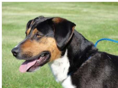
Snickers....a Friends Forever Alumni!

It takes a lot of hard work and sacrifice by the staff, board members and volunteers to get to the happy endings. It's about pets finding the right people and the right people finding the right pet. I'm so glad I can help the animals.