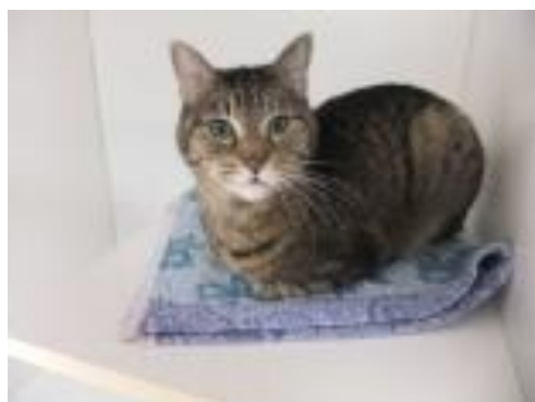
Companie Female/Spayed Domestic Short Hair/Mix 3 Years