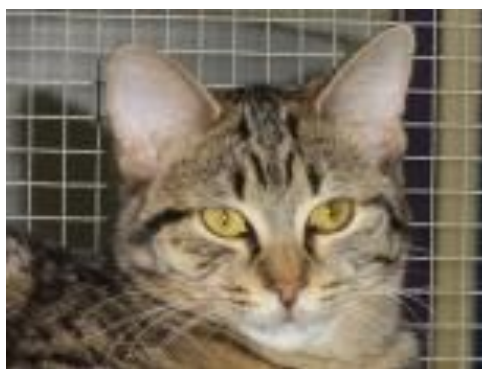
Darcy Female/Spayed Domestic Short Hair/Mix 1 Year, 3 Months