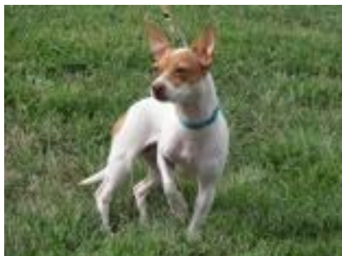
Zorra Female/Spayed Chihuahua/ Mix, Short Coat